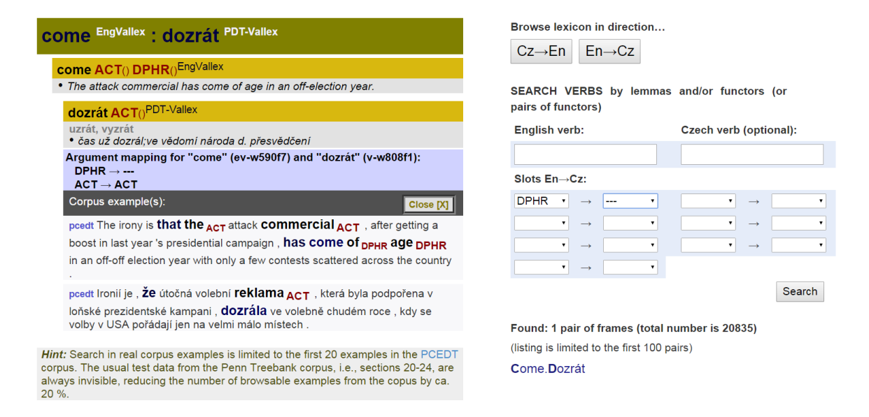
Figure 2: The old search interface

by implementing the possibility to search for the surface form constraints in the lexicon as well as in the corpus, in a bilingual setting.