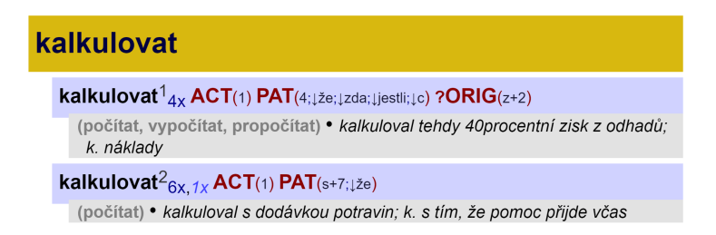
Figure 1: Czech Valency lexicon (PDT-Vallex) entry (two senses of "kalkukovat": lit. "compute" and "count on sth/sb ")

In addition, not only the Czech and English treebanks are aligned in the PCEDT, but so are the associated valency lexicons for Czech - PDT-Vallex<sup>10</sup> (Urešová, 2011b) and English - EngVallex<sup>11</sup> (Cinková, 2006), forming a bilingual parallel CzEngVallex lexicon (Urešová et al., 2016) which explicitly aligns verb senses as well as verb arguments between the two languages.