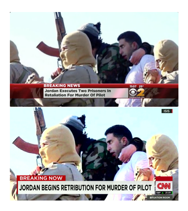
Figure 1: Similar visual contents improve detection of a coreferential event pair which has a low text-based confidence score.

To tackle this problem, a good starting point is processing the Closed Captions (CC) which is accompanying videos in newcasts. The CC is either generated by automatic speech recognition (ASR) systems or transcribed by a human stenotype operator who inputs phonetics which are