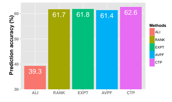
Figure 2: Micro-average over all 97,412 test points.

One weakness of CTP, as well as of other methods, is that it poorly predict ties. In the above experiment, approximately 13.5% of the preferences were 0, none of them was correctly identified. Our analysis showed that numerical accuracy is not the main cause; setting any prediction that is smaller than some values of |\varepsilon| to 0 was not found helpful. Arguably, ties need not be predicted, since if the user has no preference between two systems, any choice is just as good. Still, we believe that better ties prediction could lead to general improvement of our method and we wish to address it in future work.