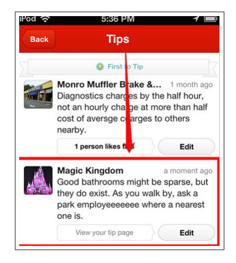
Figure 2: Tips on Yelp

isting reviews. The recommendation type of suggestions are of great importance in the case, when there is no dedicated reviews available for small shops, cafe, restaurants etc. in the vicinity of a hotel/business. Suggestions extracted from a large number of reviews, can also be seen as a kind of summarisation, an alternative or complementary to sentiment summarisation over the reviews.