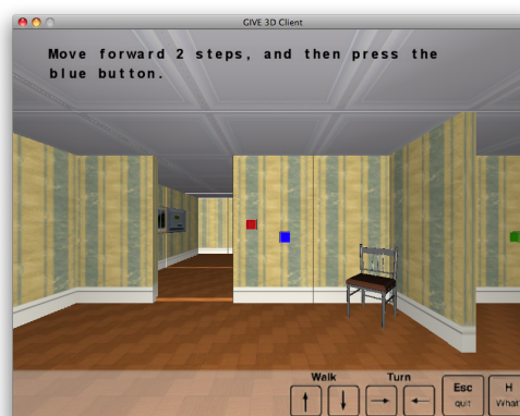
Figure 1: The GIVE Challenge.

GIVE (“Generating Instructions in Virtual Environments”) (Koller et al., 2007) is a research challenge for the NLG community designed to provide a new approach to NLG system evaluation. In the GIVE scenario, users try to solve a treasure hunt in a virtual 3D world that they have not seen before. The computer has a complete symbolic representation of the virtual environment. The challenge for the NLG system is to generate, in real time, natural-language instructions that will guide the users to the successful completion of their task (see Fig. 1). One crucial advantage of this generation task is that the NLG system and the user can be physically separated. This makes it possible to carry out a task-based evaluation over the Internet – an approach that has been shown to provide generous amounts