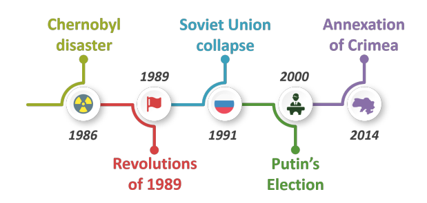
Figure 1: A timeline generated by our framework for Russia .

ble explanations from real-world drivers.