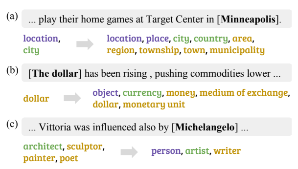
Figure 4: Examples of the noisy labels (left) and the denoised labels (right) for mentions (bold). The colors correspond to type classes: general (purple), fine-grained (green), and ultra-fine (yellow).

Denoising techniques for distant supervision have been applied extensively to relation extraction. Here, multi-instance learning and probabilis-