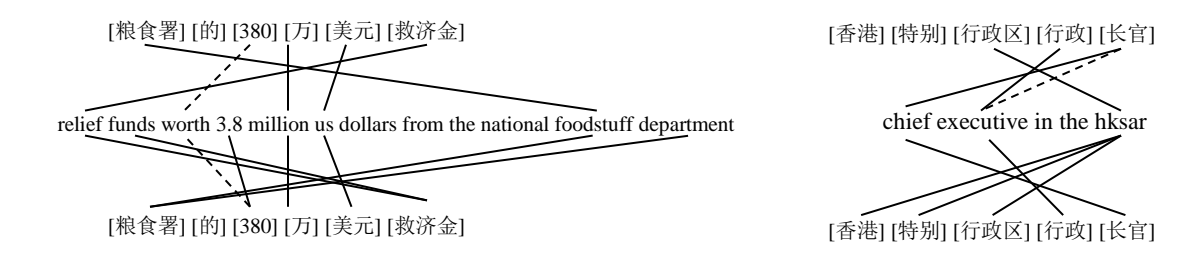
Figure 2: Two examples (left and right respectively) of word alignment on segmentation C. Baselines (DIWA) are in the top half, combined alignments are in the bottom half. The solid line represents the correct link while the dashed line represents the bad link. Each word is enclosed in square brackets.

used to measure the word alignment quality. Note that we adapted the Chinese portion of this handaligned set to segmentation C.