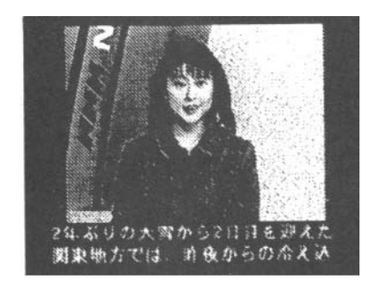
Figure 4 Captions outside of the picture

Most of the subjects preferred 2-line, outside of the picture captions without scrolling (Tanahashi, 1998). This was still a preliminary study, and we plan to conduct similar evaluation by the hearing impaired people on large scale.