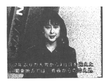
Figure 3 Captions in the picture