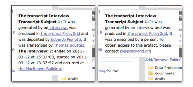
Figure 5: Two examples of text descriptions about the same transcript artifact.

The example in Figure 5 shows two text descriptions of the same interview transcript. On the lefthand side, the description is generated for a user member of the project in which the transcript was produced. On the right-hand side, the description is generated for a non-member who has indicated that he is not interested in information about users in his social network.