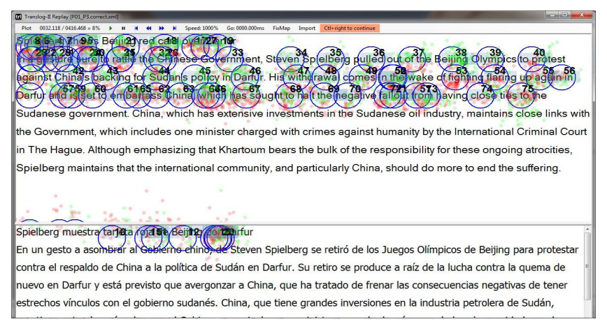
FIGURE 6 - Automatically corrected fixations