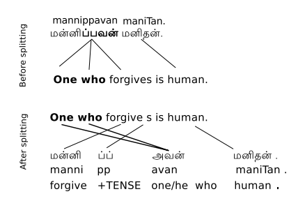
Figure 2: Suffix separation in participial nouns

Although the English morphology is not as complex as Tamil, we perform a similar rule-based suffix splitting for English. In English, we proceed in two steps: (i) tag the corpus using Stanford tagger (ii) and apply suffix splitting rules on the tagged data. This process allows us to perform suffix splitting only for certain word ending - tag combinations, thus avoiding spurious splitting. Our suffix splitting for English uses 34 tag-suffix rules. The rule has the format 'tag (T) - suffix (S) ', which means that we will separate the suffix (S) from any wordform that has the tag (T).