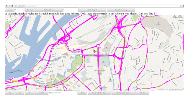
Figure 3: Map reading skills application