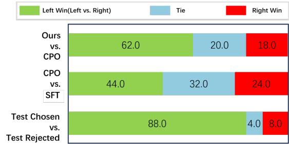
Figure 3: The experimental results of the TST task, evaluated through LLM-as-Judge, show that our method achieves better transfer consistency with the target style.

a chain comparison of SFT, CPO, and our method, and additionally compared the labeled preference data in the test set using the same judge method to verify that the evaluation approach can accurately identify the preferences. The comparison results demonstrate that our method outperforms both SFT and CPO under consistent preference evaluation. The evaluation results are presented in terms of win rate, which is calculated based on pairwise comparisons conducted by LLM-as-Judge. To ensure the reliability and robustness of the evaluation, each pairwise comparison was performed twice independently. Only when the two independent assessments yielded consistent results was a winner determined; otherwise, the outcome was considered a tie. This rigorous approach minimizes potential biases and enhances the credibility of the evaluation process.