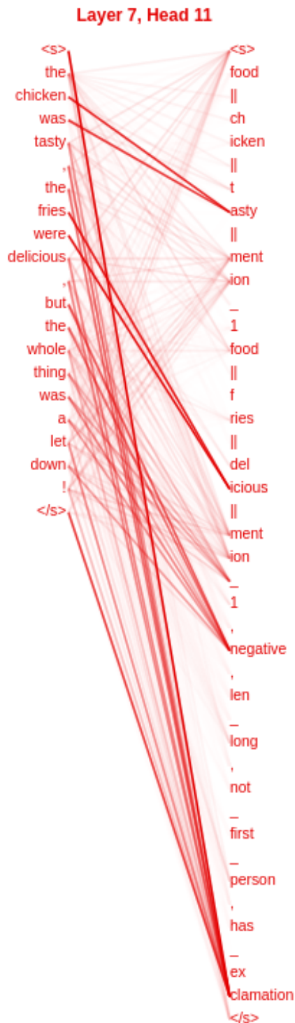
Figure 3: The food items 'chicken' and 'fries' in the output sentence are attending to their associated adjectives tags 'tasty' and 'delicious' in the input in L7H11.