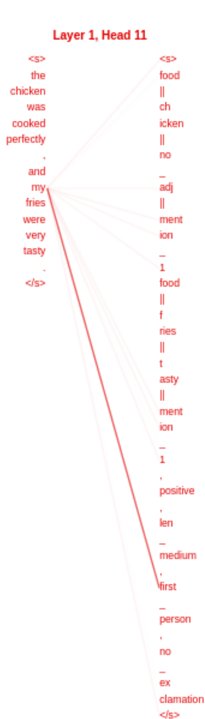
Figure 1: The first person reference 'my' in the output sentence is attending to 'first' token in the input in L1H11.