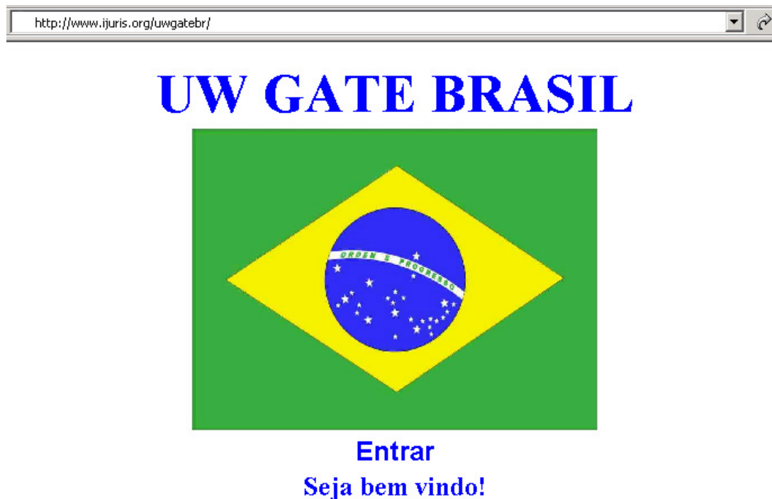
Fig. 1. UW Gate Brazil Home page

So, the UWs had been created locally and restricted the attributes to the general form. To store and retrieve the locally created UWs and to improve and reduce the time of UNL sentences codification, the Brazilian research group of UFSC ( Federal University of Santa Catarina ) has developed a tool, based on UNL Center's Universal Word Gate, called UWGATEBR ( http://www.ijuris.org/uwgatebr/ ) (Figure 1). Also, as verified on the development of Environment Audit application, this tool allows a progressive study of the UW restrictions, from the most general to the most specific, improving the best format to be used in the application without compromise the whole process because the UWs stored in the UWGATEBR database can be edited in any time. Consequently, the syntax errors of UNL code will be minimized before its use in Deconverter , reducing the rework and the development time.