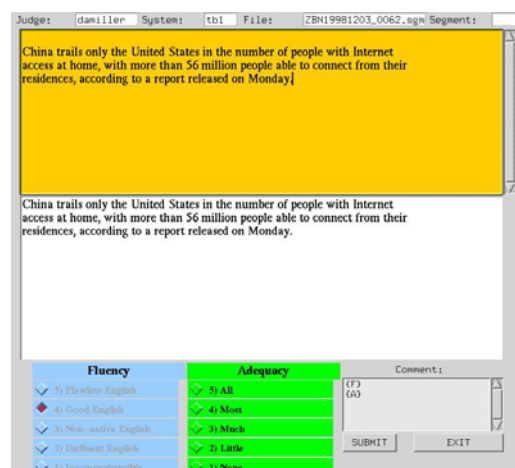
Figure 2: Interface for adequacy judgment