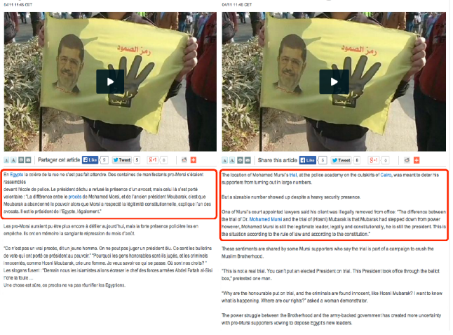
Figure 1: Example of multimodal comparable corpora from the Euronews website.

Pro-Mursi supporters condemn Cairo trial as illegal