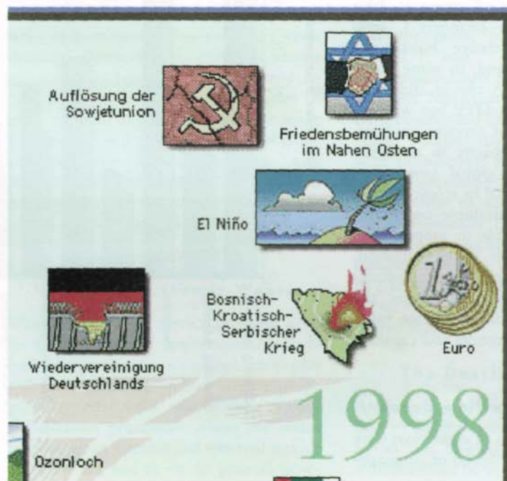
Added to the German version of the Timeline

Meeting the challenges was only possible with the close cooperation of all parties involved. Microsoft was consulted on all issues involving budget and schedule changes.