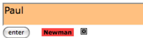
Figure 1: Interactive Machine Translation. Caitra uses the search graph of the machine translation decoder to suggest words and phrases to continue the translation.

the translation word by word, she is aided by a machine translation system that interactively makes suggestions for completing the sentence, and updates these suggestions based on user input. The scenario is very similar to the auto-completion function for words, search terms, email addresses, etc. in modern office applications.