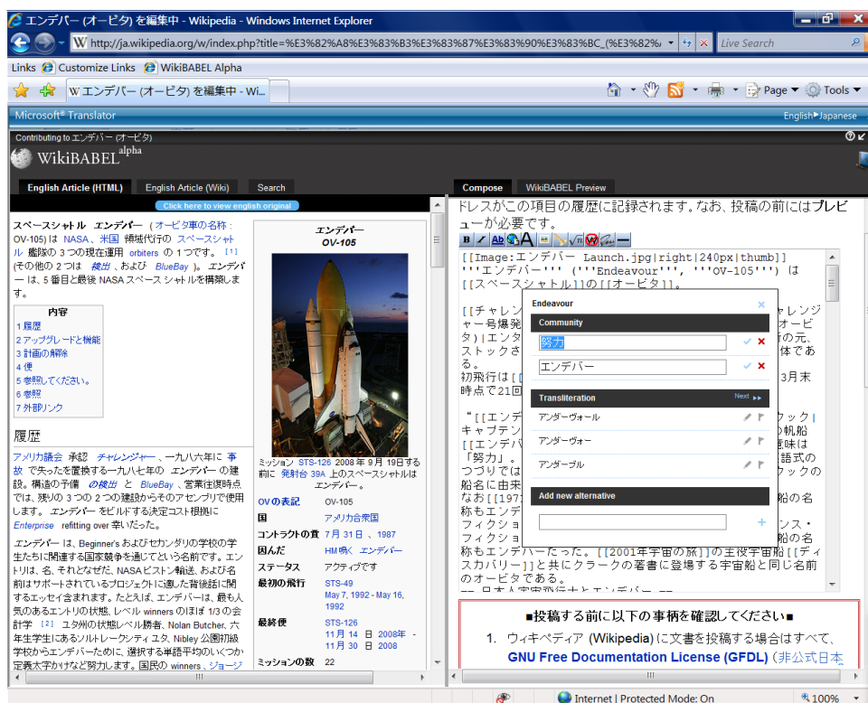
Figure 3: WikiBABEL Version 2

content creator may be an English Wikipedia article for which no corresponding article exists in the target language, or at target language Wikipedia article which has much less content compared to the corresponding English article.