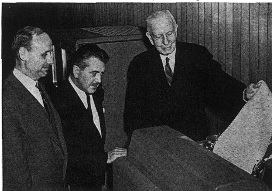
IBM'S WATSON (right) AND FRIENDS:† For a mathematical wizard . . .

[From: Chemical Week , January 30, 1954; p.46 and 48]