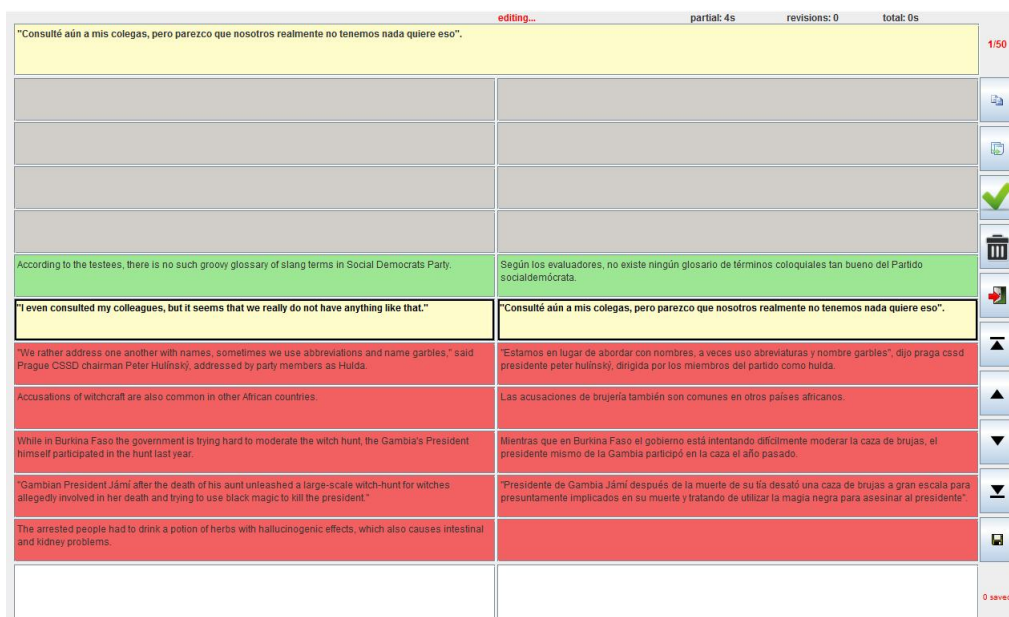
Figure 1: Annotation window

translation/editing of the unit started.