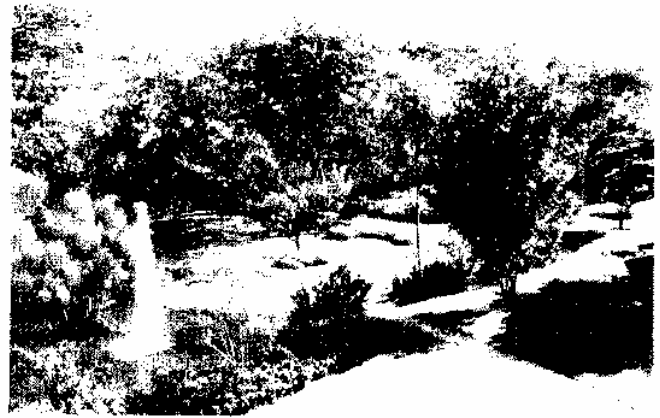
Aerial view of Misión del Sol with mountains in the distance