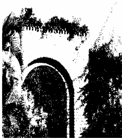
Entrance to Misión del Sol

using machine translation, some were using MT in relatively traditional ways, while some were using it on-line in very innovative ways. What follows is a sampling of ideas, implementations, and anecdotes both from the workshop and from those parts of the regular conference program that addressed the interests and concerns of people who use MT to accomplish real tasks. A more detailed account is scheduled to appear in the International Journal of Translation in 2001.