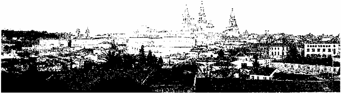
Panoramic view of Santiago de Compostela