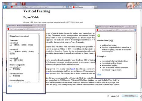
Figure 1. REAP interface and features for a student whose native language is Mandarin.

From the beginning, REAP has shown that it can improve students' acquisition of new vocabulary in English (Heilman et al., 2006). Features embedded in REAP have been validated in several experimental studies which showed the learning outcomes achieved by the students. REAP has been used to study motivation as well as learning gains.